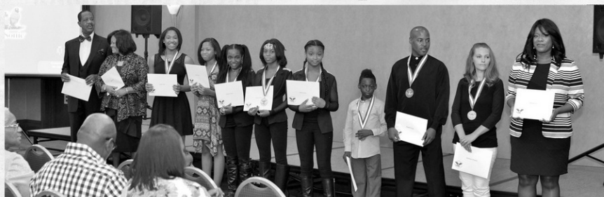
Winners of the President's Volunteer Service Awards were recognized Aug. 1.

"This year a $500 gift was awarded to I Am B.E.A.U.T.I.F.U.L., a nonprofit organization that engages girls in interactive learning experiences designed to build self-esteem and strong leadership skills."