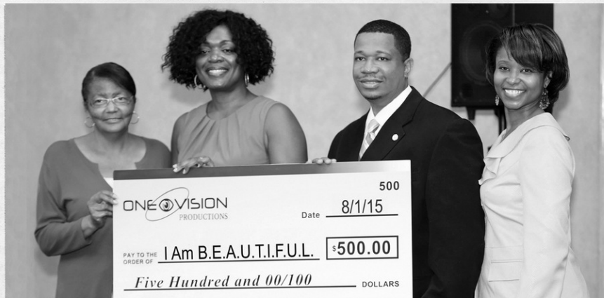
Members of the nonprofit I Am B.E.A.U.T.I.F.U.L. received the Pay It Forward Award.