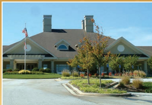
Smoke Rise Country Club (770) 908-2582 4900 Chedworth Drive | Stone Mountain, GA 30087