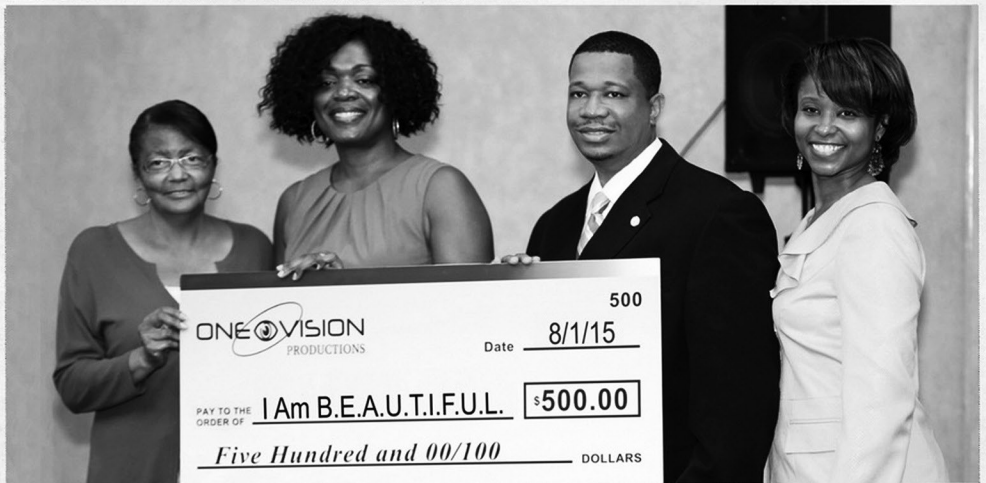
Members of the nonprofit I Am B.E.A.U.T.I.F.U.L. received the Pay It Forward Award.