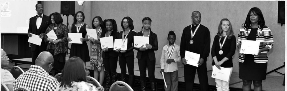
Winners of the President's Volunteer Service Awards were recognized Aug. 1.

"This year a $500 gift was awarded to I Am B.E.A.U.T.I.F.U.L., a nonprofit organization that engages girls in interactive learning experiences designed to build self-esteem and strong leadership skills."